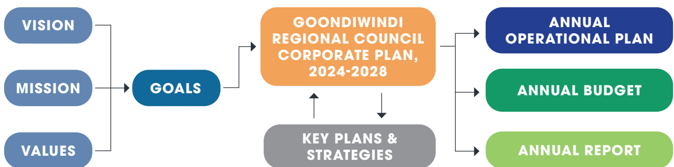
Goondiwindi Regional Council's Corporate Plan in Context

The Corporate Plan will be implemented through the annual operational plan and budget. These documents will be monitored by Council throughout each year (quarterly) and will be used as the basis of reporting performance through Council's Annual Report.