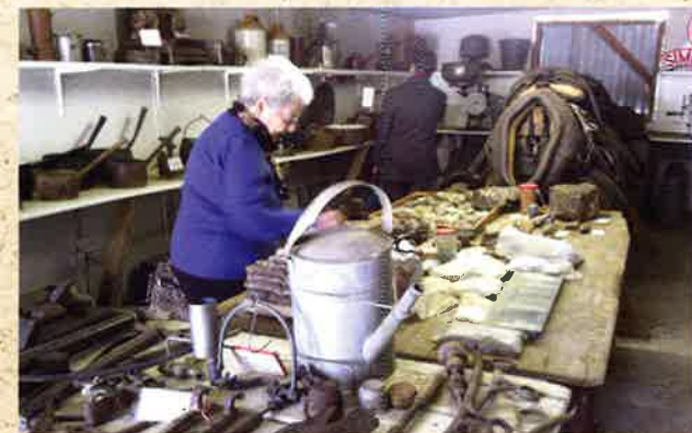
Explore the many interesting exhibits within the Museum