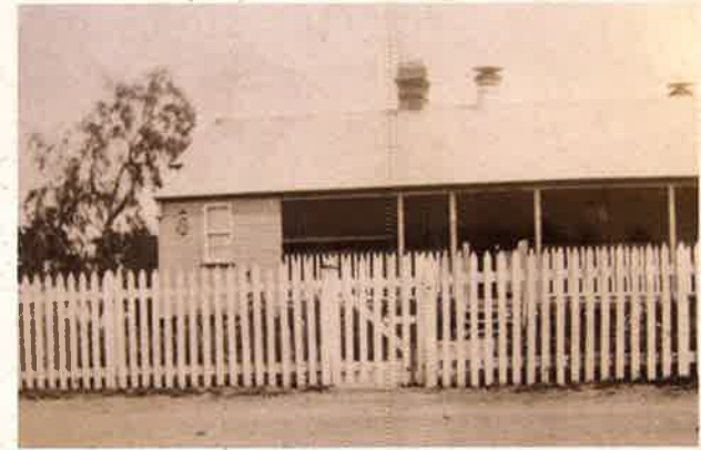
1930 - Police Sergeant's Residence - now part of the Texas Heritage Centre

The Museum contains all equipment used in the labour intensive tobacco industry and photographs of men and women at work.