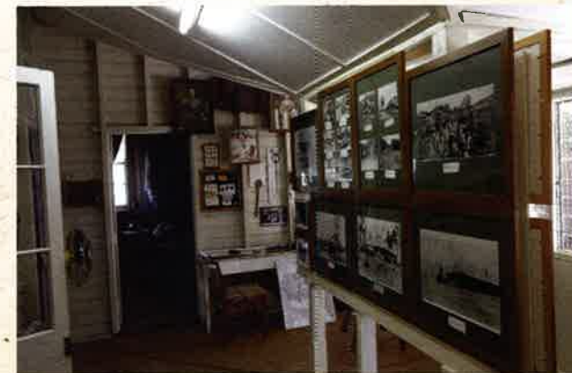
Collection of photos showcasing Texas throughout the years